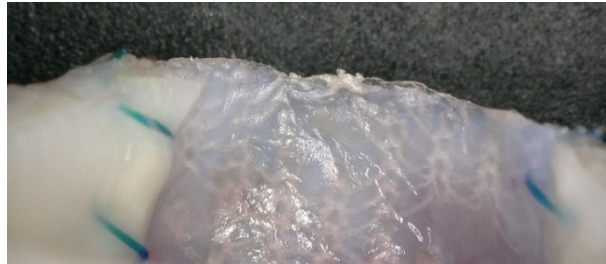
Developed own native tissue over the OFT-G1 (pre-clinical study)

Thanks to medical advances in recent decades, the vast majority of pediatric patients with heart diseases reach adulthood. A considerable number of these patients, however, eventually require re-interventions, such as repeat surgery or catheter therapy, due to problems with the implanted surgical materials. There still exist unsolved drawbacks of the existing materials, such as deterioration, calcification, and thickening with pseudo-intimal proliferation. Furthermore, such materials have no size adaptability to body growth. As a result, hemodynamic disturbance often occurred again to be treated by the re-interventions in their long life.