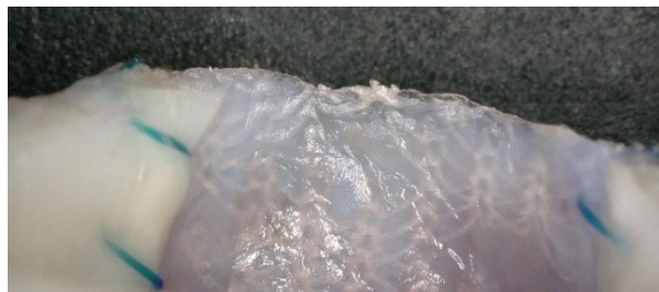
Developed own native tissue over the OFT-G1 (pre-clinical study)

Thanks to medical advances in recent decades, the vast majority of pediatric patients with heart diseases reach adulthood. A considerable number of these patients, however, eventually require re-interventions, such as repeat surgery or catheter therapy, due to problems with the implanted surgical materials. There still exist unsolved drawbacks of the existing materials, such as deterioration, calcification, and thickening with pseudo-intimal proliferation. Furthermore, such materials have no size adaptability to body growth. As a result, hemodynamic disturbance often occurs again to be treated by the re-interventions in their long life.